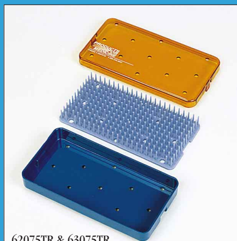
62075TR & 63075TR