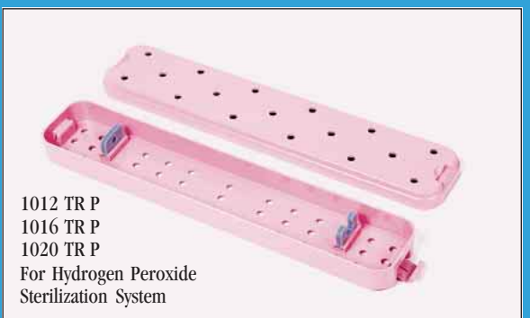
1012 TR P 1016 TR P 1020 TR P For Hydrogen Peroxide Sterilization System