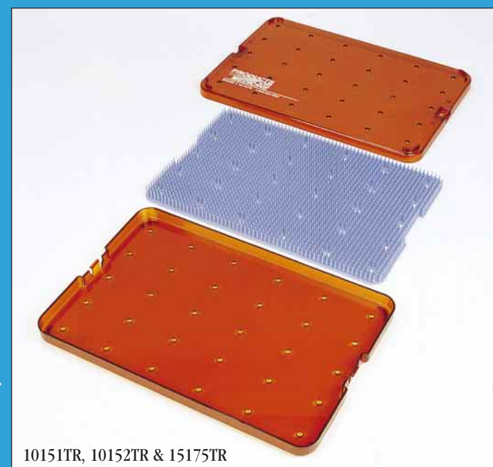
10151TR, 10152TR & 15175TR