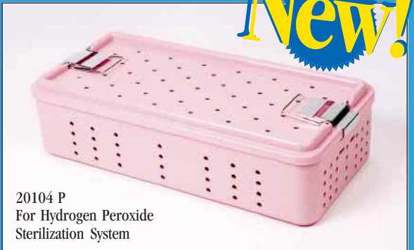
20104 P For Hydrogen Peroxide Sterilization System