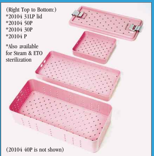
(Right Top to Bottom:) *20104 31LP lid *20104 50P *20104 30P *20104 P *Also available for Steam & ETO sterilization (20104 40P is not shown)