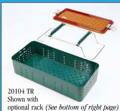
20104 TR Shown with optional rack (See bottom of right page)